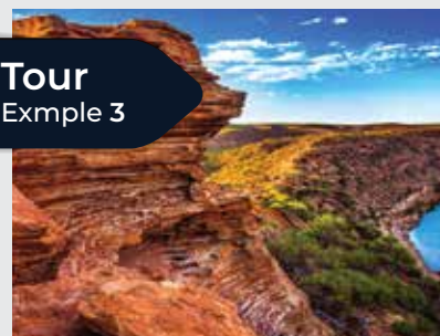
Tour Exmple 3

A fun, social three-day Margaret River getaway featuring scenic drives, local produce, charming towns, and two nights at the award-winning Timothee Resort near Busselton.