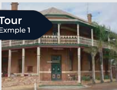
Tour Exmple 1

LET US DESIGN YOUR DREAM JOURNEY, OR EXPLORE OUR READY-MADE ADVENTURES.